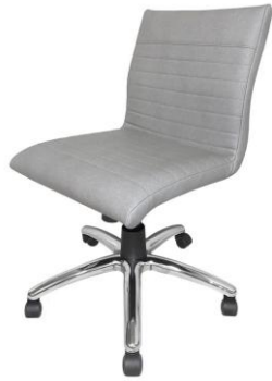
268-DKB LB (ARMLESS)