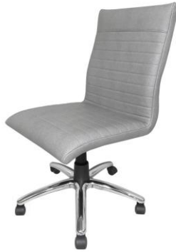
268-DKB HB (ARMLESS)